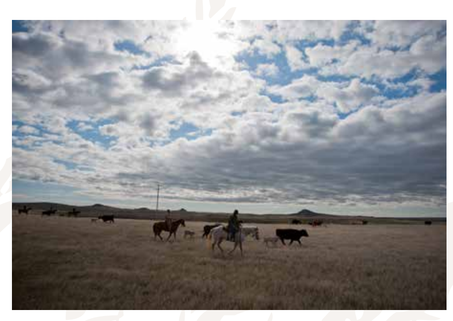
Holistic Planned Grazing in practice: Northern Great Plains, United States.