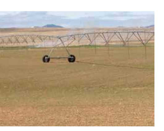
High intensity agriculture is heavily dependent on fossil fuel energy imports and irrigation, as shown on this former grassland in Oregon, United States.

The future challenges to humankind are considerable, with climate change at the top of the list. It is projected that food production, which is entirely dependent on a benign climate, will have to increase by 50% by 2050 to keep pace with global population needs ( Millennium Ecosystem Assessment, 2005 ).