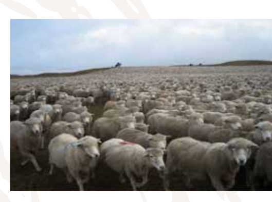
Properly managed livestock building soil organic matter in Patagonia, Chile, being moved as planned to ensure adequate plant recovery.

Neighboring, paired site comparison in Australia. The soil on the left is from a pasture in which groundcover has been actively managed (no-tilled cropped and holistically grazed) to enhance photosynthetic capacity. On the right, the soil is from a conventionally managed farm (10 meters through the fence) that has been set-stocked and has a long history of phosphate application.