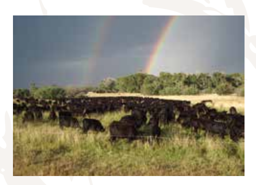
Holistically managed grassfed beef at Two Dot Ranch, Montana, United States.

If we were to capture 1 ton of carbon per acre per year on the roughly 5 billion hectares of grasslands worldwide, we would remove 12 Gt of C from the atmosphere per year, that is, 6 ppm annually. If gross soil sequestration were approximately 6 ppm/year, after subtracting current annual carbon emissions of 2.5 ppm/year net sequestration would be 3.5 ppm per year.