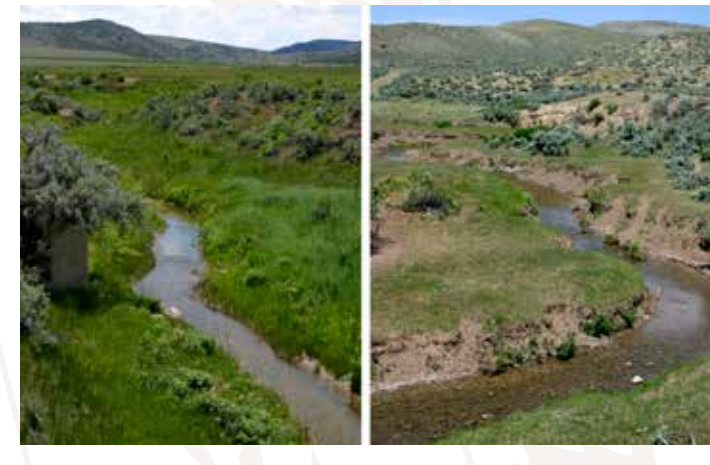
Photo of stream in Wyoming, United States, taken moments apart standing on a bridge. Left: Upstream Land - properly managed using Holistic Management (150% increase in livestock numbers); Downstream Land managed conventionally.