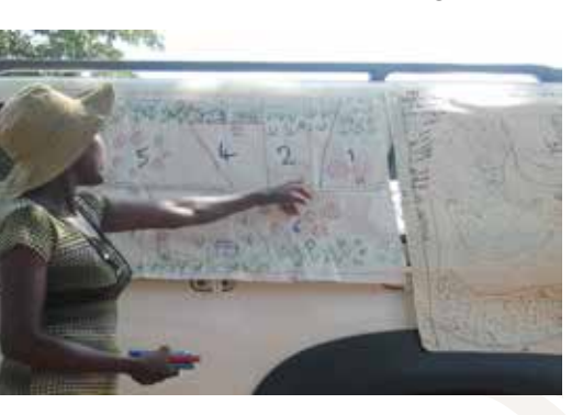
Holistic Grazing and Land Planning in Zimbabwe

When implementing the Holistic Grazing Plan, animals are herded in tight groups, confined to relatively