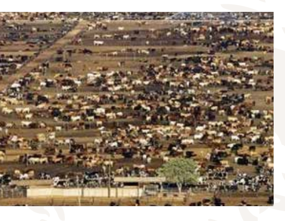
A typical, modern way to raise beef in feedlots.

On pastures that were seeded with perennial grasses organic matter went from under 2% to 7.3% with grazing alone.