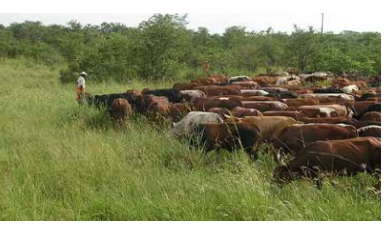
Properly managed livestock used to restore and maintain the health of this Zimbabwean grassland.

Globally, grasslands comprise 40% of the global land surface area, excluding Greenland and Antarctica and have been degrading primarily through cultivation and improperly managed livestock practices (Millennium Ecosystem Assessment, 2005).