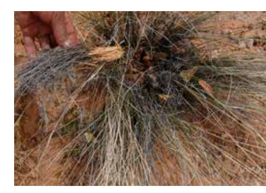
Dying plant and deteriorating soil due to over-rest.

By using the tools of grazing and animal impact and paying attention to adequate plant recovery, in a period of as few as three years, many longdisabled processes come back to life. For example, insects such as dung beetles return. They retrieve ruminant excreta and store it more than 18 inches beneath the surface creating new soil and storing carbon in the process (Richardson & Richardson, 2000). Worms and small mammals such as moles and prairie dogs churn the soil, while deep-rooted perennial grasses regrow and create channels for water and gases. Mycorrhizal fungi, with literally thousands of miles of hyphae in a small patch, transport nutrients which they have the unique ability to obtain minerals from soil and exchange them for carbohydrates from photosynthetic plants. The fungi synthesize a stable glycoprotein, glomalin that holds 4 to 20 times its weight in water. Microorganisms join the elaborate fray, and in the process create complex carbon molecules that store carbon deep in the soils for a long period of time (Jones, 2009a). These are the healthy soils that Holistic Managers throughout the world strive to recreate, capturing carbon, providing food, re-establishing balanced hydrological and nutrient cycles, and imparting beauty to the land (see next page).