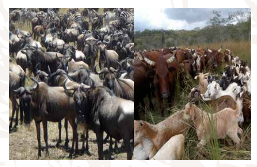
On the right, a mixed herd of goats and cattle managed to mimic the wildebeest and zebra on the left.

Holistic Planned Grazing renews the proper relationship of grazing animals to grasslands by insuring that the animals are in the right place, at the right time, with the right behavior, for the right reasons.