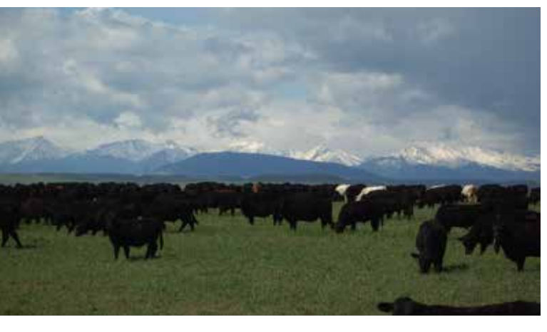
An adaptive and flexible framework to restore ecosystem function in Colorado, United States

At least one billion people depend on grasslands for their livelihoods mostly through livestock production for food and fiber ( Ragab & Prudhomme, 2002 ). Therefore, there are huge economic and social costs associated with the degradation of grasslands apart from the diminished role they are able to play in sequestering carbon.