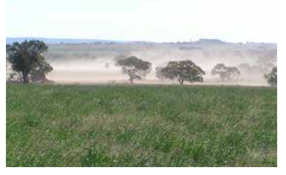
Holistic planned grazing in the foreground. Loss of soil organic matter due to lack of ground cover and conventional management in the distance.

There are several conventional assumptions in different mainstream disciplines that are obstacles to re-establishing the evolutionary grassland-grazer relationship for long-term sequestration of carbon in soils and restoring atmospheric carbon dioxide to pre-industrial levels. Each of these disciplines—climate science and advocacy, rangeland science, and soil science—contributes its own prevailing assumptions.