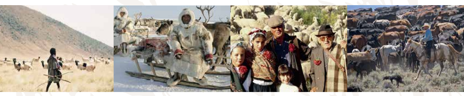
Grasslands are home to 1 billion people with pastoral traditions (from the Masai to the herder, to the gaucho to the cowboy). Not only do their traditions affect the management of grasslands, their management of this complexity affects all of humanity.

It is well known that terrestrial environments are important global carbon sinks (Prentice, et al., 2001; Schimel, et al., 2001) and the size of this sink depends on the grasslands of the world (Pacala et al., 2001) therefore, the most feasible and costeffective approach to carbon sequestration is in restoring the massive sink in degraded grassland soils.