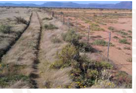
South Africa with very erratic 200mm of rain. The land on the left has been holistically managed since the 1970s. The land on the right is an example of what results with over-rest.

small paddocks (either by permanent fence, but more likely now with temporary electric fence and/or herding), having intense but brief impact (several hours to a few days) on the land. They eat the grasses, forbs, and shrubs available—the more diverse the better ( Provenza , 2007).