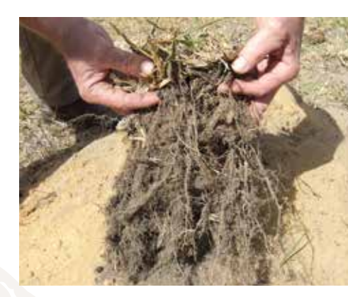
showing the dark colored carbon sequestered around the roots of perennial grasses.

When grazing animals eat perennial grasses, the root systems die back and become feed for communities of bacteria (Baskin, 2005), leaving porous passages and carbon-rich biomolecules which are aggregated into a sticky substance called humus (Pucheta, Bonamici, Cabido, and Diaz, 2004). The following season the root systems regrow along with the plants above ground, and the process will repeat itself, increasing soil porosity, water and, carbon content annually. Lignin, glomalin, and protein fragments from root dieback, along with humus created by bacterial action comprise the process of humification, which is part of the liquid carbon pathway ( Jones, 2009a ). Humus is critically important in water retention, balancing minerals, and adjusting pH and is why healthy soils are dark in color (like elemental carbon and is shown in the photo to the right), relatively low in density, and clump, not crumble, when handled.